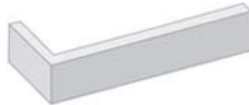
Norman Corner 2 1/4 x 3 5/8 x 11 5/8