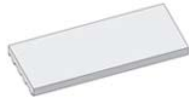
Utility 3 5/8 x 11 5/8 3 pcs/sq ft