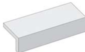
Norman Edge Cap 3 5/8 x 2 1/4 x 11 5/8

All brick is 5/8" thick. Custom sizes and colors are also available.