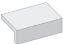
Modular Edge Cap 2 1/4 x 3 5/8 x 7 5/8