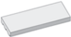
Modular 2 1/4 x 7 5/8 7 pcs/sq ft