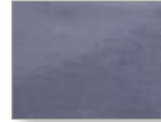
MBRE140 COLD FRONT