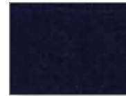
MBRE215 BIG BLUE